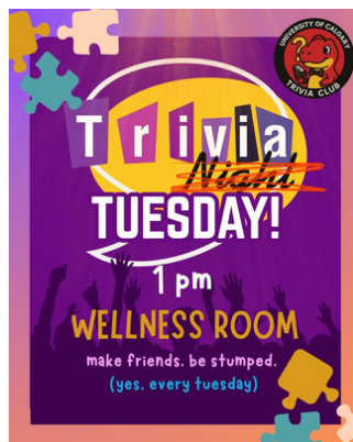
Weekly Trivia Tuesdays with ~15 people/week