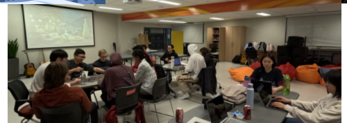
December Drop-in Event