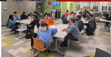
November Jeopardy Night