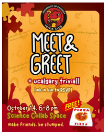
Over 40 students attended our October Meet & Greet!