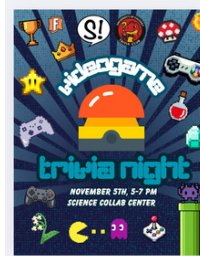
UCTC x Shenanigans Club Collaboration Event: Video Game Trivia